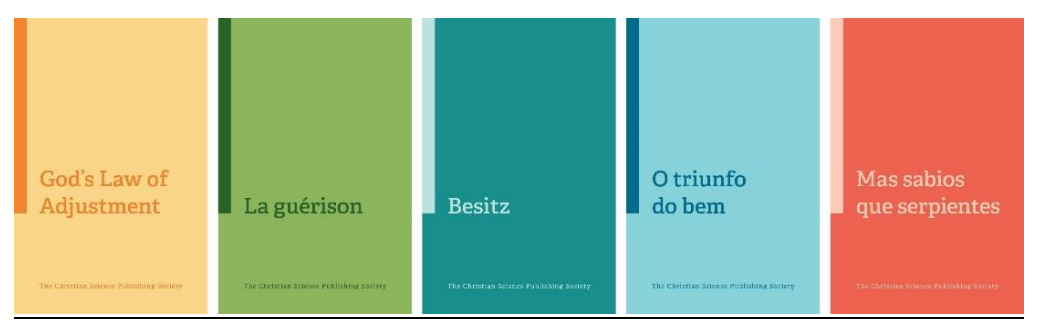
NEW: Pamphlets: Redesigned with Updated Translations (date of first announcement 8/31/2021)

We're delighted to share that updated translations of the following classic pamphlet titles are now available for purchase: God's Law of Adjustment, Healing, Possession, Triumph of Good, and Wiser Than Serpents . Each conveniently sized and portable collection of articles and testimonies has undergone a high-quality redesign. The translations reflect the most recent approved translations of the Bible and Science and Health with Key to the Scriptures, by Mary Baker Eddy, as well as various changes in language that have gone into place since the last translations were made. The new pamphlets are easily identified by the clean, updated, cover design, and by referencing the product numbers listed below.