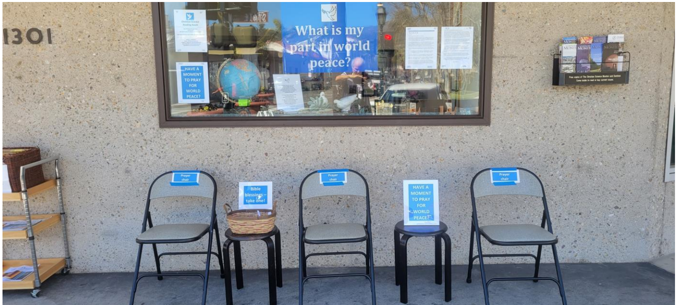
From First Church of Christ, Scientist, Santa Barbara, California, USA

In praying about the situation in Ukraine, First Church of Christ, Scientist, Santa Barbara, California has set out Prayer Chairs outside of their Reading Room. Additionally, there is a film festival in town, so there is a lot of foot traffic from people attending screenings.